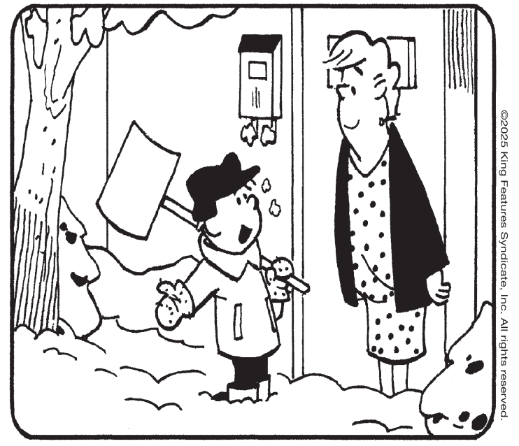
missing. 6. House is not as wide. missing from mailbox. 4. Doorknob is missing. 5. Zipper is Differences: 1. Shovel is shorter. 2. Arm is lower. 3. Snow is