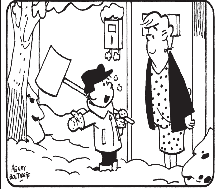
Find at least six differences in details between panels.