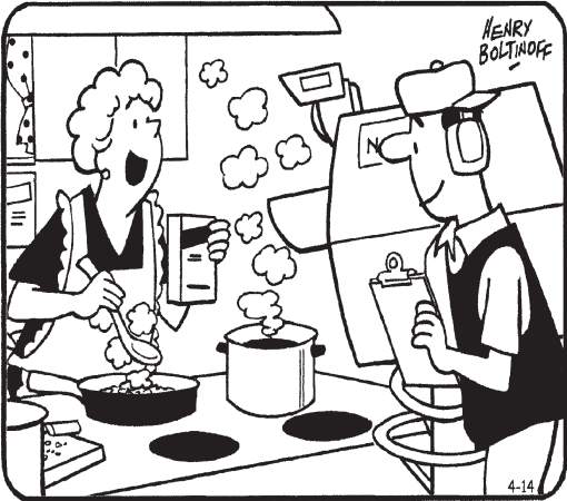
Find at least six differences in details between panels.